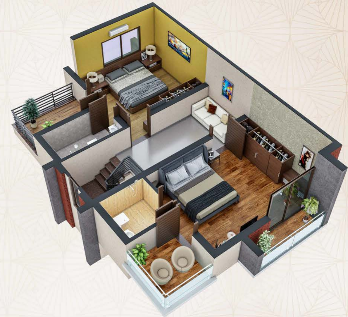
ISOMETRIC VIEW OF 3BHK BUNGALOW FIRST FLOOR : Plot No 01 to 19