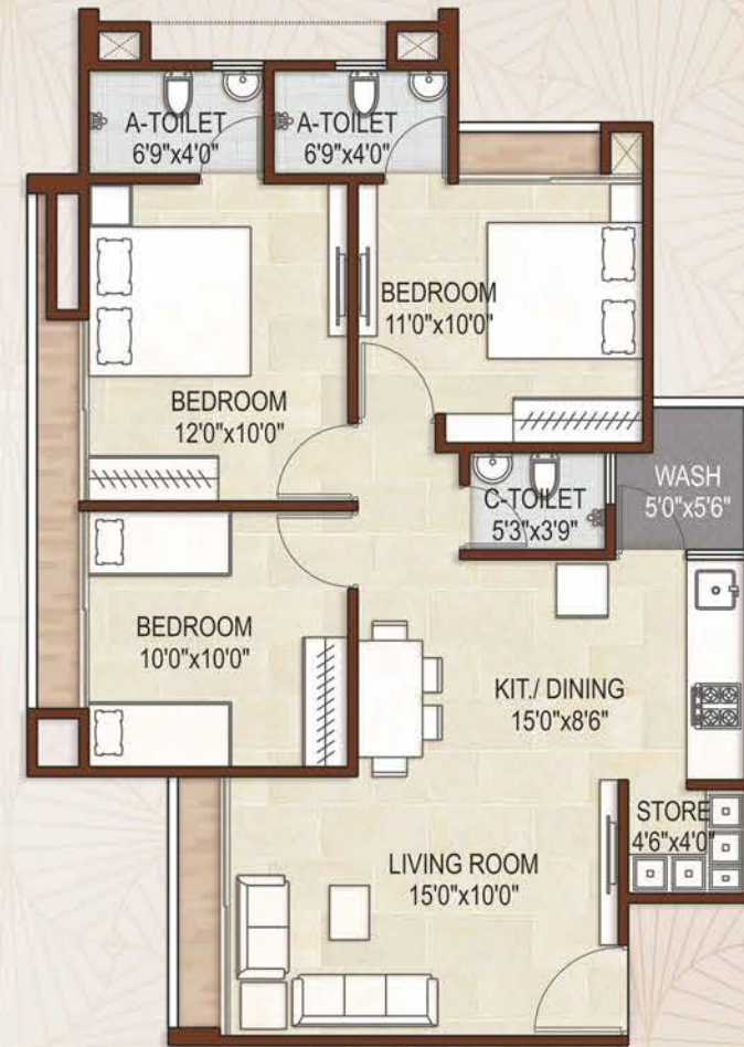
Typical Unit Plan 3 BHK Flats Built-up : 900 sqft