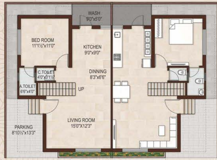
GROUND FLOOR PLAN - Twin Layout