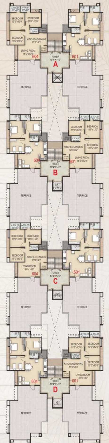
Sixth Floor Plan