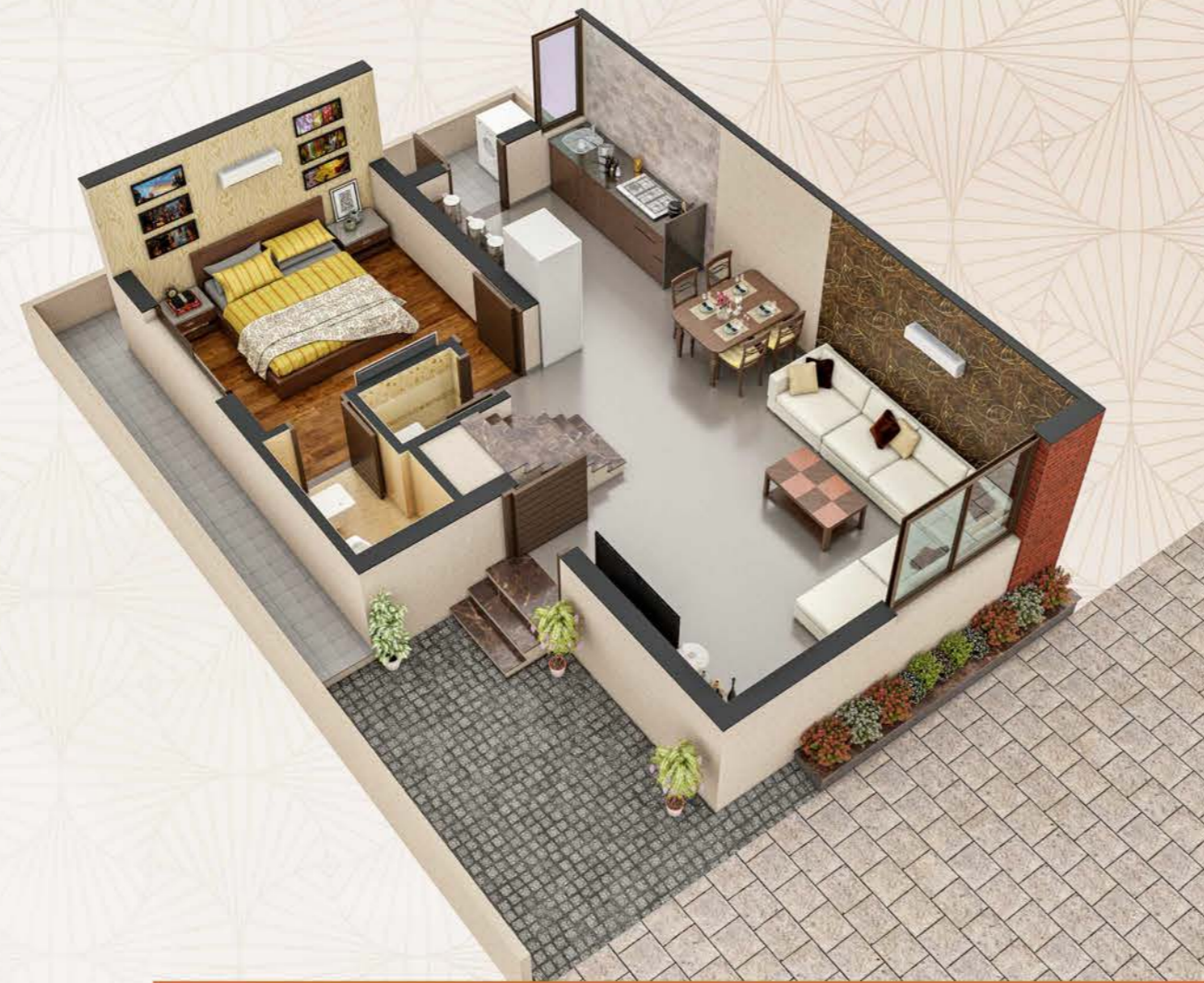
ISOMETRIC VIEW OF 3BHK BUNGALOW GROUND FLOOR : Plot No 01 to 19