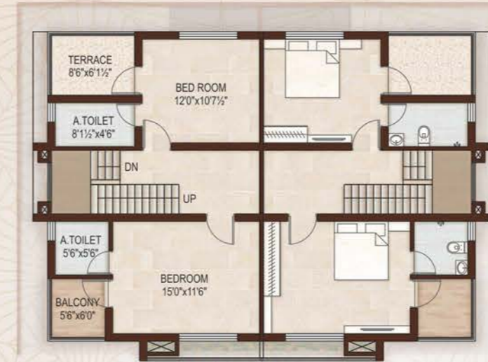
FIRST FLOOR PLAN - Twin Layout