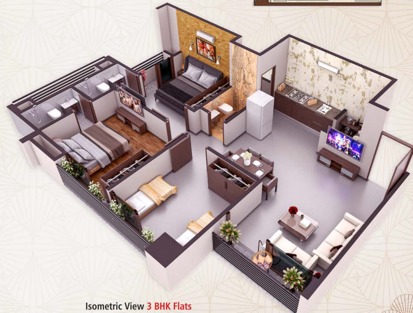
Isometric View 3 BHK Flats